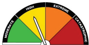
FIRE DANGER RATING