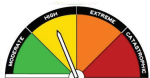
NEW FIRE DANGER RATING

DFES Fire Reports / Burn Register 1800 198 140